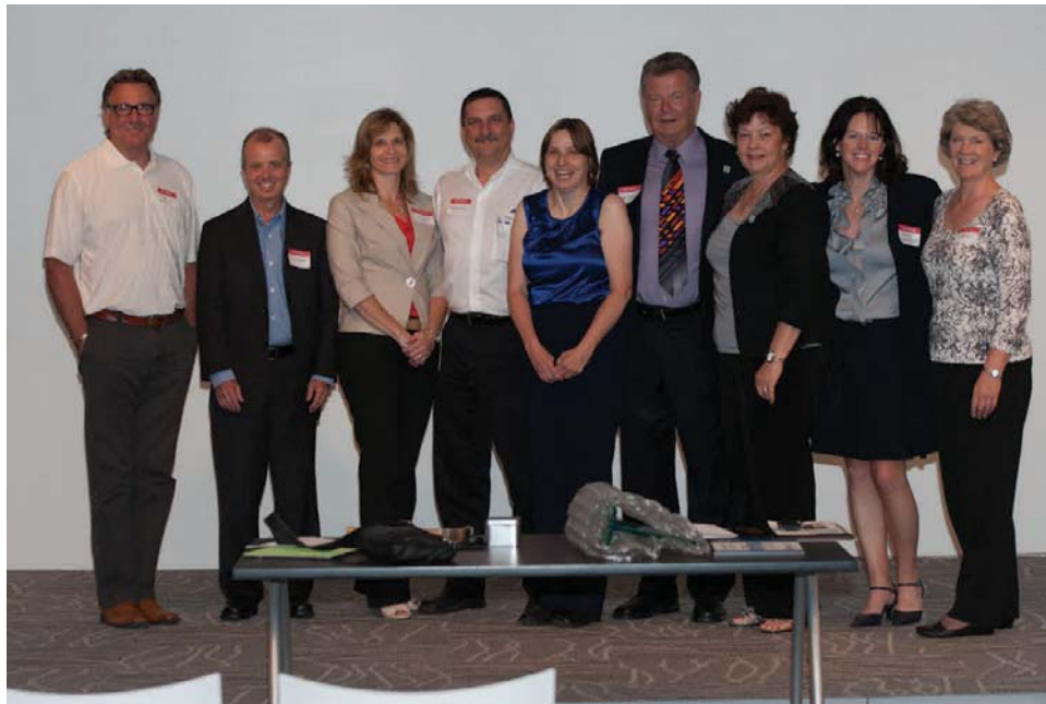
From our AGM May 2012