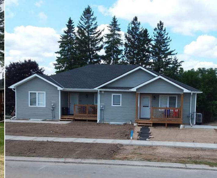
Drumbo, Oxford County

Energy efficient passive-house design principles were incorporated into the construction of this beautiful Brant County home. An airtight building envelope in combination with other design features, resulted in a +80% reduction in energy cost compared to a standard home. We also reduced the build cost, the construction timeline and environmental impacts by using prefabricated panelized walls.