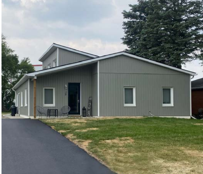
Oakhill, Brant County

5 Indigenous housing builds underway in collaboration with Habitat Hamilton