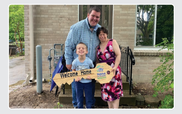
1788 Culver Dr. London, ON - single family home.