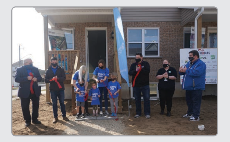
92 and 94 Scott St. Thomas, ON - duplex property for two families.