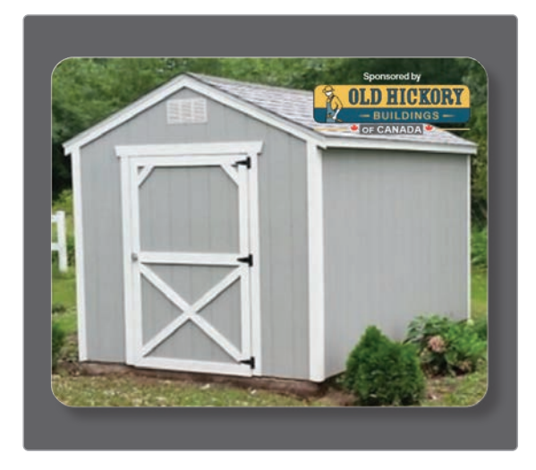
Sheds for Humanity - Grand Prize shed, sponsored by Old Hickory Buildings